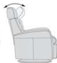
ADJUSTABLE HEAD- AND NECK SUPPORT