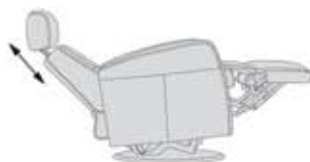
HEIGHT ADJUSTABLE HEADREST SYSTEM