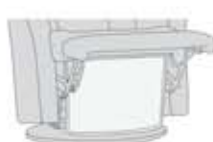
FRONT SKIRT OPTION